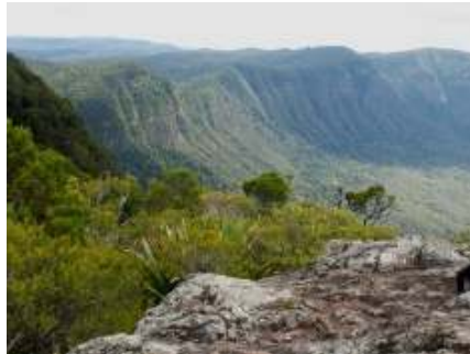
View from Bare Rock towards Sylvester's Lookout

Thanks everyone for a great walk and a great day out.