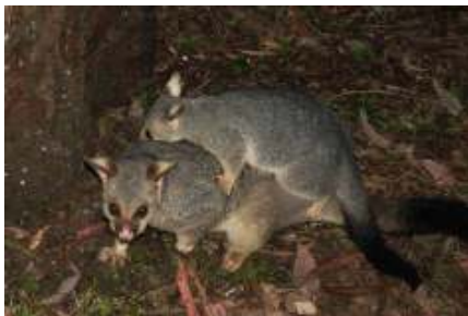
Mum and Baby Possum

A mother and baby possum came by during the evening searching for food. Some pesky birds kept trying to get to our food during the afternoon. The baby possum was half the size of its mother and kept jumping on its mother's back.