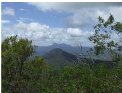
View of Mt Warning from Wagawn