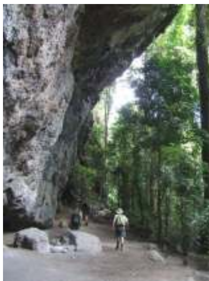
View in the Bushrangers Cave